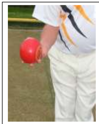
Elbow Tucked In