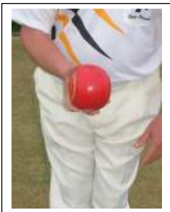
Centre of the Body